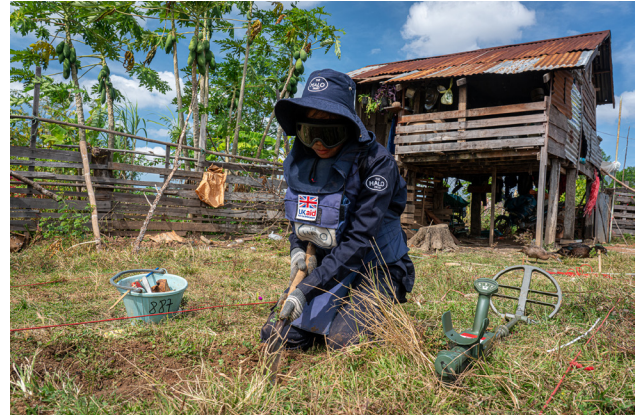
A HALO technician clearing next to a house in Nonxai Village, Phin District