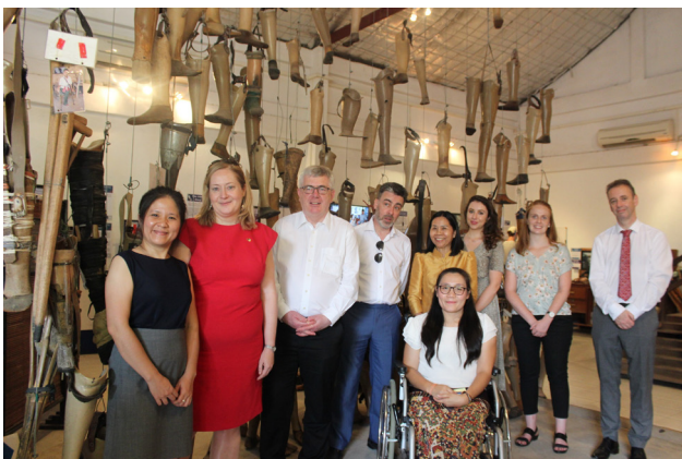
Welcome Irish Ambassador