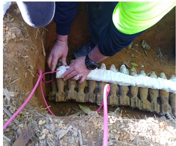
Explosive demolition of abandoned ordnance for Phu Bia Mining