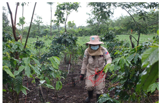
Female Surveyor (BAC Team 8) uses rope to make clearance lanes inside a coffee farm, Dansavang village, Paksong district, Champasak province, May 2020