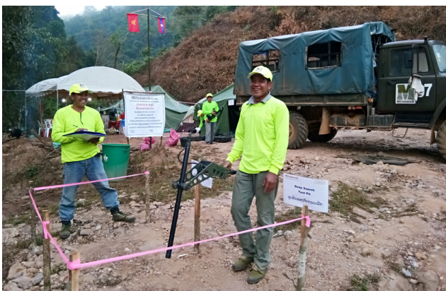
Equipment Test pit for Magnetometer utilized for NTPC Nakai District, Khammuane Province

Milsearch ended 2020 with 343 days without a lost time injury.