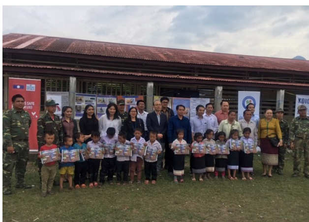
The MRE activity at Thongviengkham School in Laksao District, Bolikhamxay Province with more than 300 students in attendance

In 2020, a field visit for the KOICA representative was organised to Borlikhamxay province. Several articles and media posts were published during the year detailing the work of the sector. KOICA's contribution to the UXO Sector was acknowledged through various media in Lao PDR. Also, the KOICA logo was displayed on the NRA and the humanitarian team of Lao People's Army equipment.