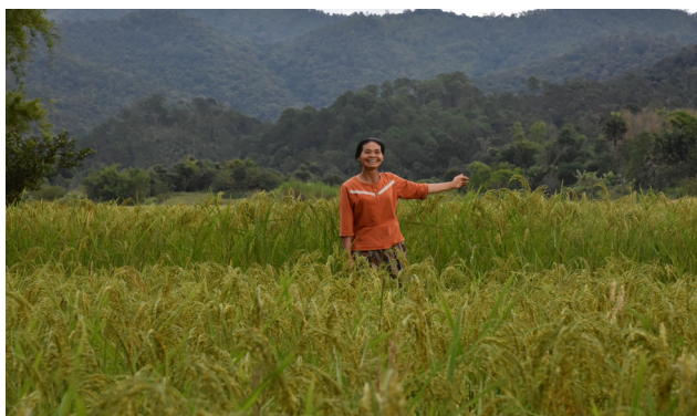
Bounchan showing us her beautiful rice field and free from UXO

On March 2019, UXO Lao XK TS team surveyed the area, they found 15 cluster bomblets (BLU 26) of 4.9. From 11st to 20th February 2020, the clearance team found 88 cluster munitions of which, 81 are BLU26 and 7 ammunitions.