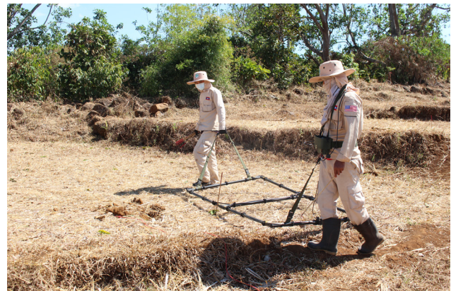
USDOS-funded NPA BAC team uses a large-loop detector, Saravane province, February 2020